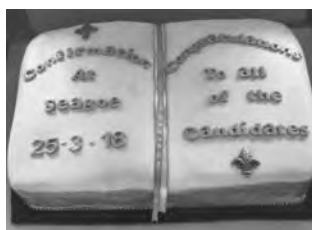
The confirmation cake!

After the service, candidates, their families and guests were invited for a celebration in the Parish centre. There were speeches, presentations of bibles to the candidates and most importantly, there was food. The diocese brought along their trusty chocolate fountain and each of the candidates brought along desserts. We also had a wonderful confirmation cake which was supplied by one of the parents. It was a wonderful event and it was a real privilege to stand alongside our candidates as they were confirmed. Thanks to all parents for encouraging their young people to attend and thanks also go to the dedicated team of leaders who assisted in the preparation classes and the weekend away. Please continue to uphold the candidates in your prayers.